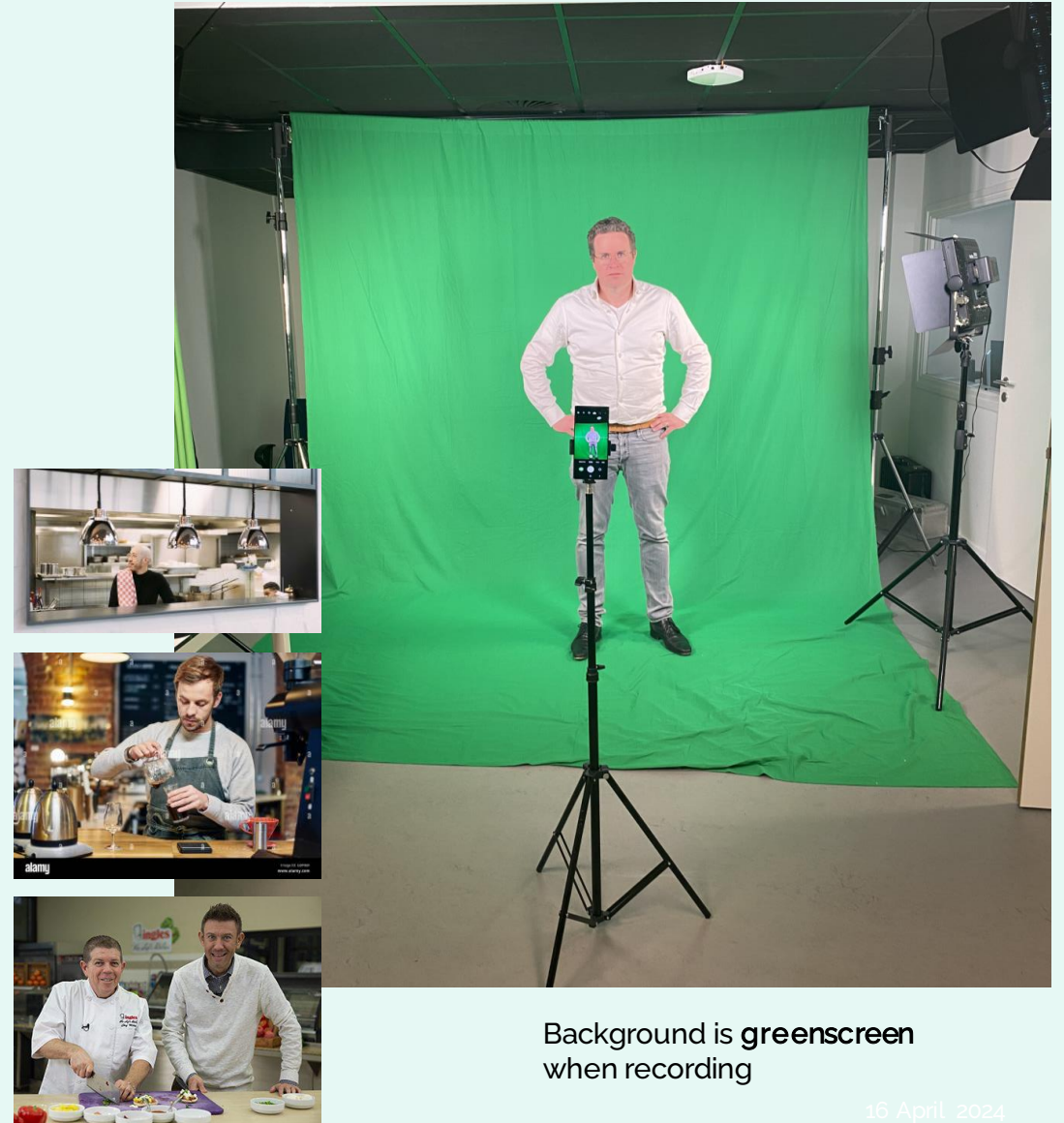
Background is greenscreen when recording

Computer to edit / remove the green, and enrich with links and flow